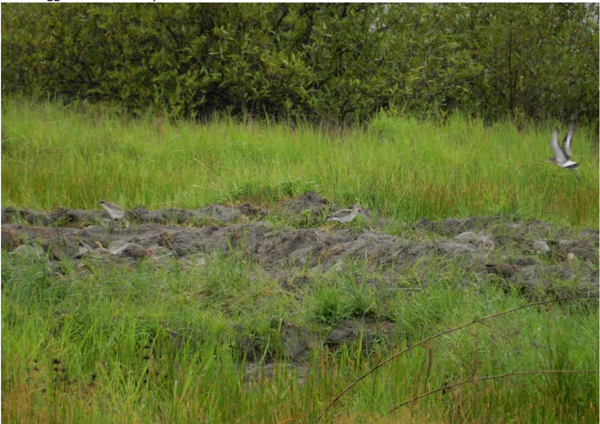
Godwits foraging on earthworms on the ploughed rice paddies.