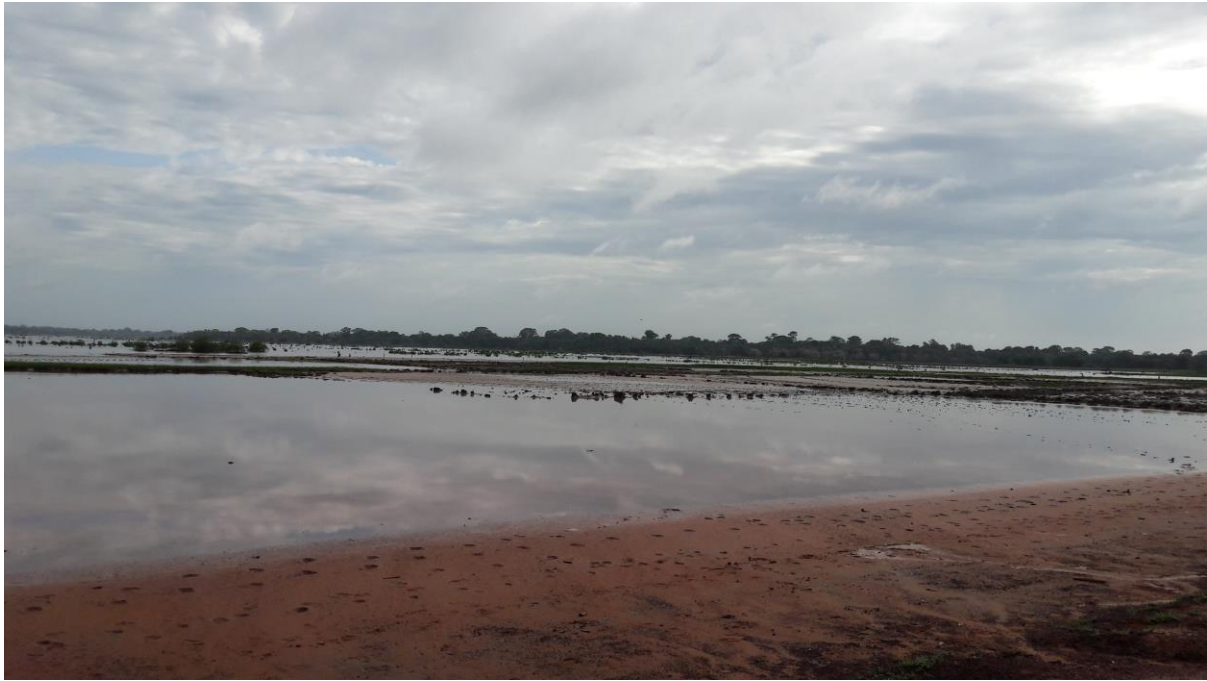
The shores of the mangrove wetland at Tobor.