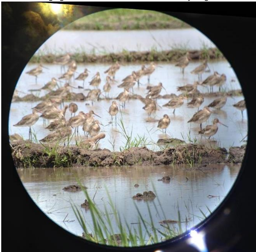
Godwits resting and preening in a ploughed rice paddy, in the rice fields of Agnack.