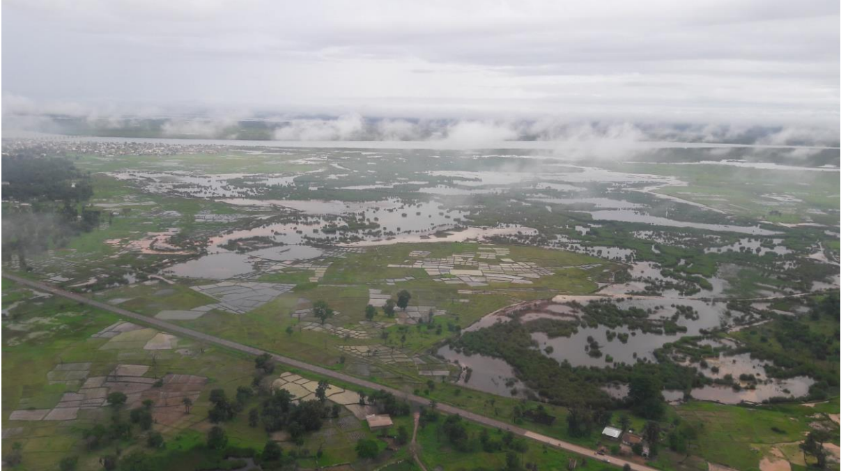
View from the plane of the rice fields adjacent to Ziguinchor, it's the rainy season! The soil is waterlogged and the rice paddies are filled with water.

It kept on raining (>70 mm today!) and on the way back to Bignona we stopped at the Colobane rice fields. But it was already getting too dark and most birds had probably already left to the roost. We only read 1 codeflag.